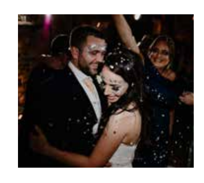
7:30 PM Your moment as a newlywed couple to cut the cake and have your first dance.