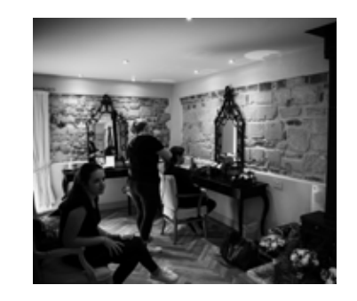
10 AM You and your wedding party begin getting ready in the Preparation Room.