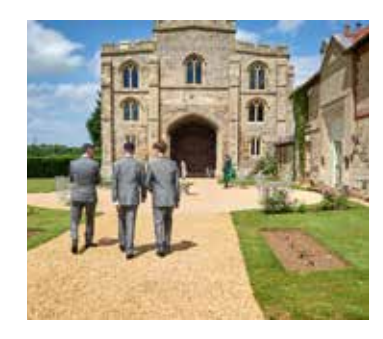
3 PM Any guests staying in the accommodation can now check in.