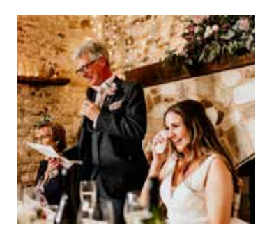
6:30 PM Time for the allimportant speeches.