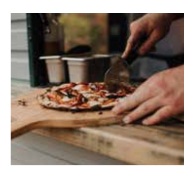
9 PM Party the night away with your guests and enjoy a choice of evening food.