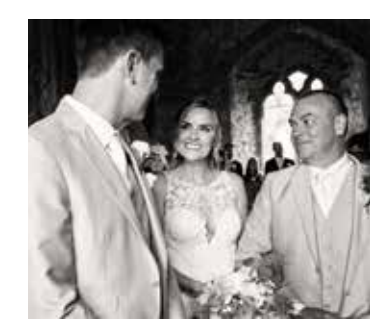
2 PM It's time for your ceremony in your choice of location.