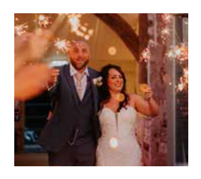
Midnight Your music comes to an end – time to retreat to your Honeymoon Suite.